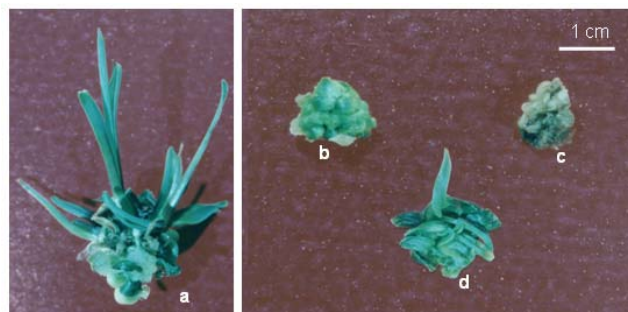
Figure 1. MT hybrid caulogenic calli 35 days after in vitro culture: (a) Shoot elongation in the basic medium with 2,4-D; (b-c-d) Calli exposed to different NaCl concentrations; (b) Caulogenesis inhibition; (c) Necrosis; (d)- Caulogenesis (at least one shoot).

maize and Tripsacum chromosomes pairing, which suggest the possibility of genetic recombination between parental species (Molina et al. 2005). In this context, maize x T. dactyloides F1 hybrids could be a source of salinity tolerance to use in a maize improvement program.